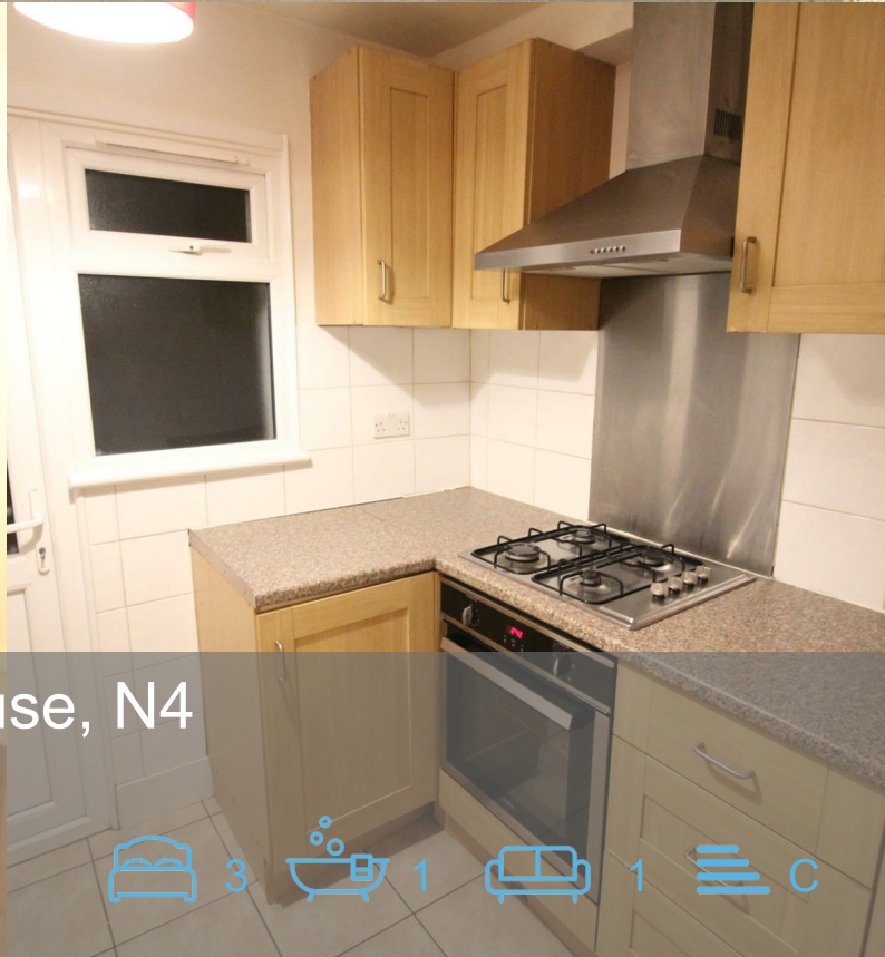
Hermitage Road, Manor House, N4